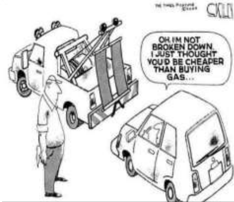
A car fainted after seeing the price of gas.